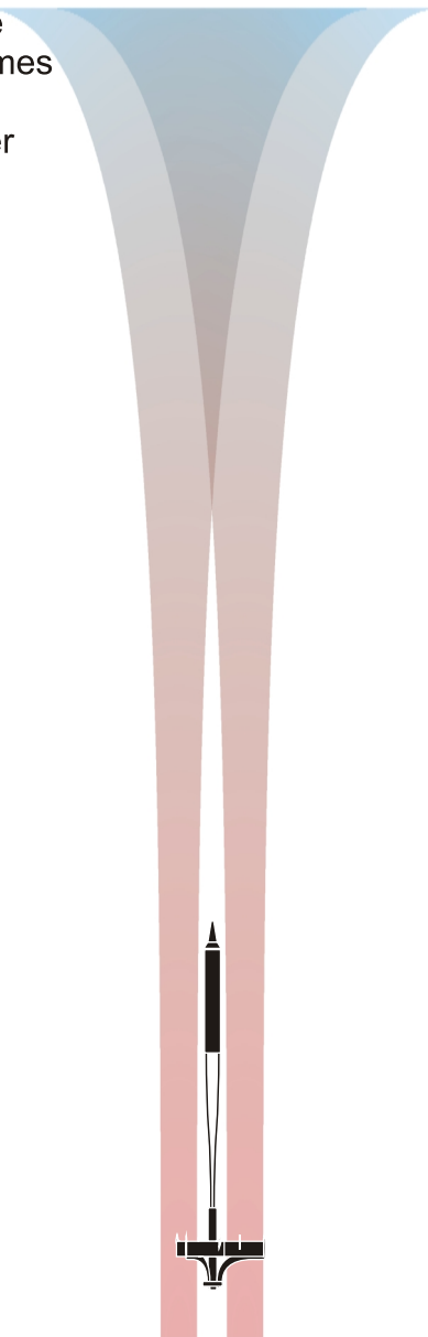
As speed increases the depth of the magnetic field increases as does its distance from the ship